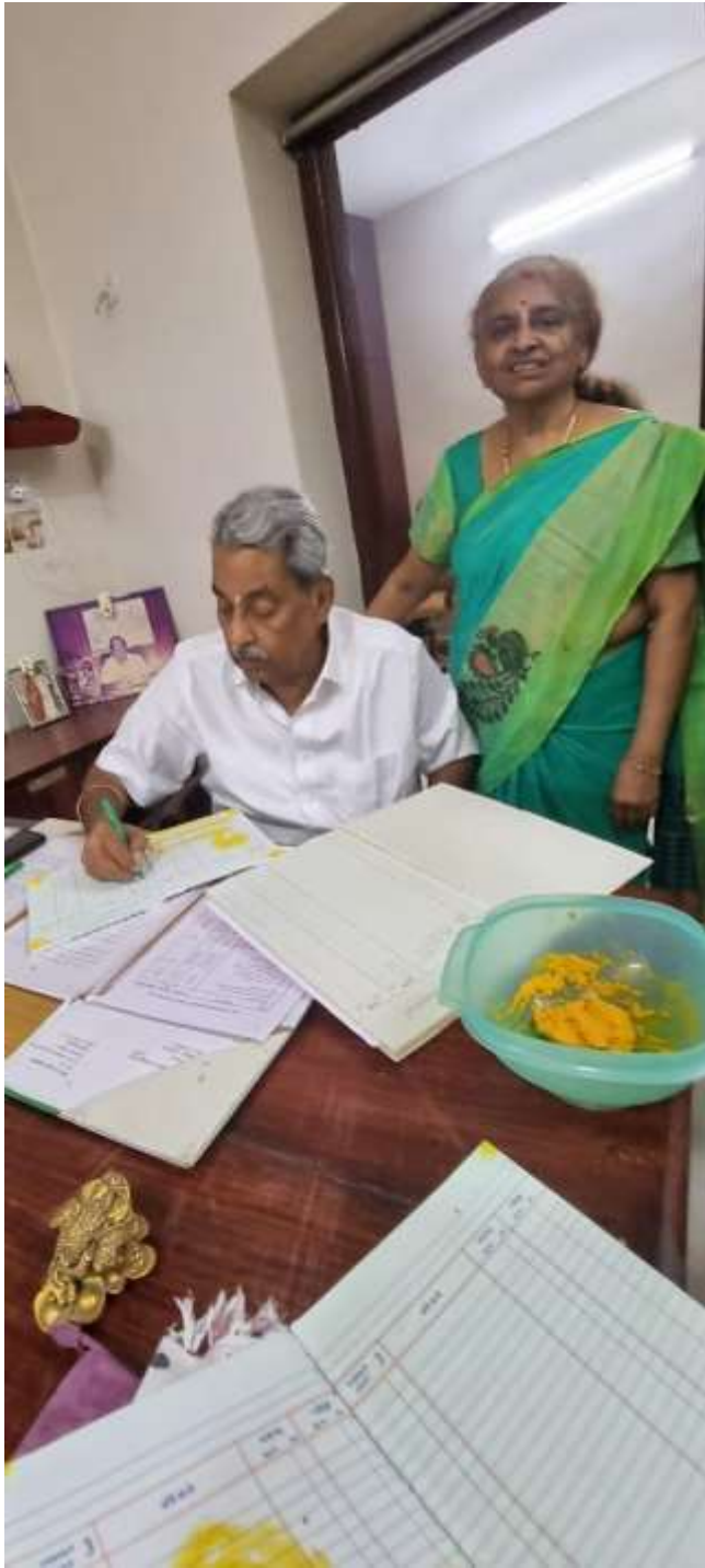
"New Books of Accounts* opened after a brief Pooja in all PSTS Logistics Offices.