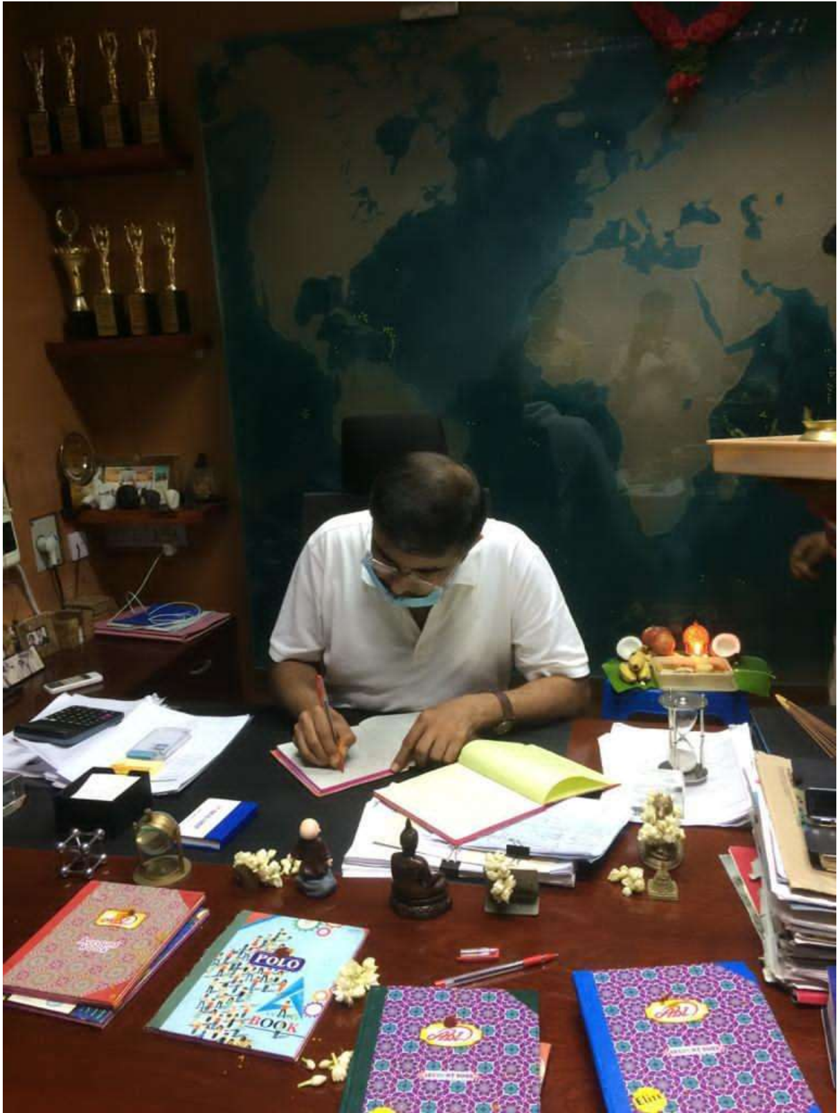
*New Books of Accounts* opened after a brief Pooja in all PSTS Logistics Offices.