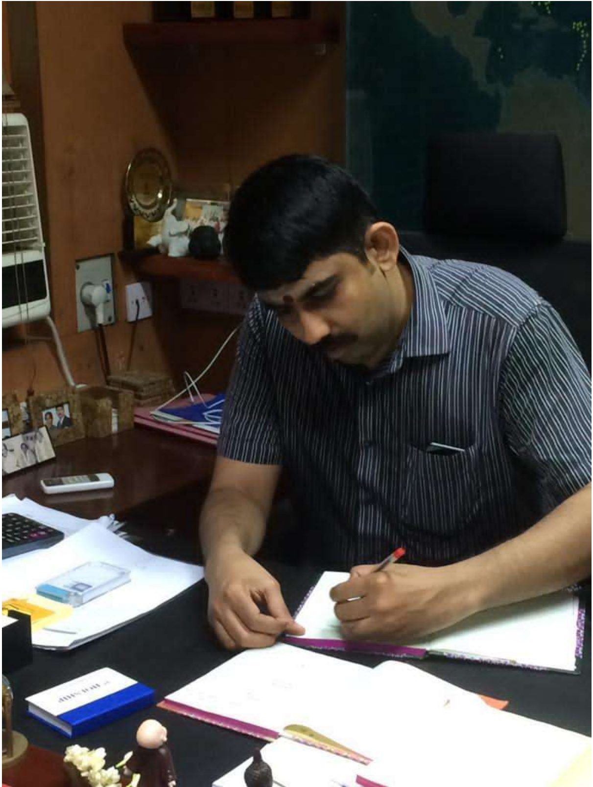
*New Books of Accounts* opened after a brief Pooja in all PSTS Logistics Offices.